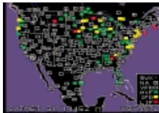
CATMET Categorial METAR