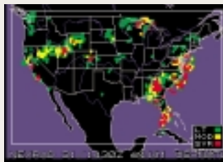
U.S. National/Regional NEXRAD

TAKES ADVANTAGE OF EXISTING FMS INSTALLATIONS